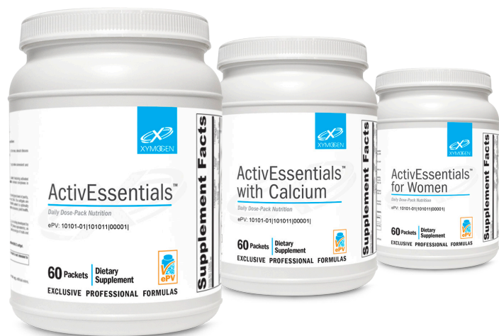
Available in 60 packets